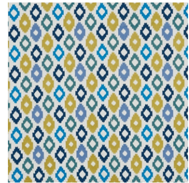
Cassia Sea Grass