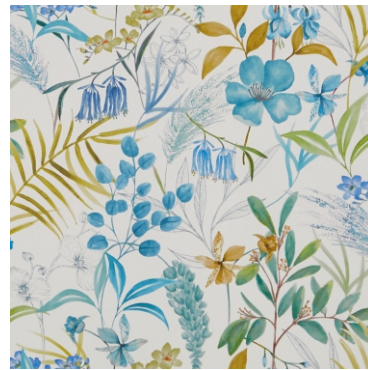
Honeysuckle Sea Grass