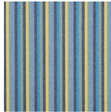
Lambrooke Sea Grass