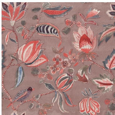
Azalea Passion Fruit