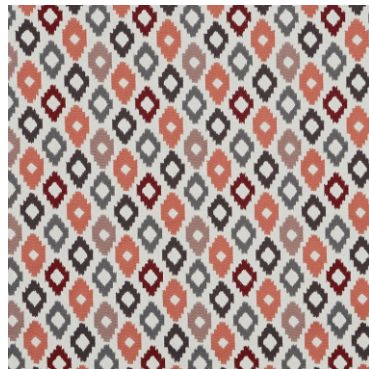
Cassia Passion Fruit