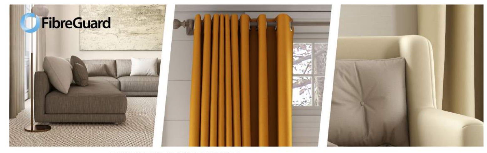
DESERTIA & WOOLSKIN ~ multi purpose textured plains

This gorgeous collection of plains has something for everyone when it comes to colour and texture. The two designs, Desertia and Woolskin are unique in their own way. Desertia is a strie inspired design that has taken the normally subtle understated strie to a higher level with a more pronounced and textural stripe effect. The end result is the ultimate dual purpose fabric that will be as beautiful on the window as it will on the couch. Woolskin has a unique texture that is tough and enduring for upholstery as well as soft and comforting for drapes. Combine this with its subtle brushed quality and it is guaranteed to stand out from the rest.