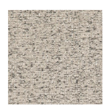
Omni Raffia 100% Polyester Approx. 145cm wide Plain Upholstery 100,000 Rubs FibreGuard | Flame Retardant