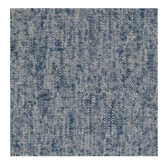
Omni Marine 100% Polyester Approx. 145cm wide Plain Upholstery 100,000 Rubs FibreGuard | Flame Retardant