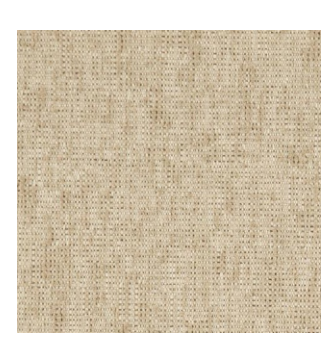
Omni Sesame 100% Polyester Approx. 145cm wide Plain Upholstery 100,000 Rubs FibreGuard | Flame Retardant