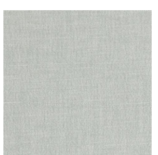
Maldives Limestone 68% Polyester/32% Cotton Approx. 138cm wide Plain Dual Purpose 40,000 Rubs FibreGuard | Flame Retardant