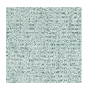
Omni Mineral 100% Polyester Approx. 145cm wide Plain Upholstery 100,000 Rubs FibreGuard | Flame Retardant