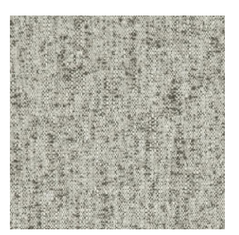
Omni Fossil 100% Polyester Approx. 145cm wide Plain Upholstery 100,000 Rubs FibreGuard | Flame Retardant