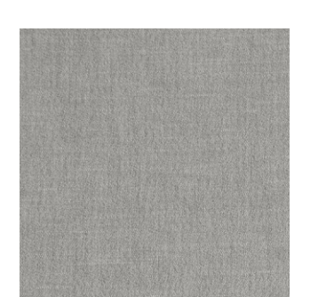
Maldives Silver 68% Polyester/32% Cotton Approx. 138cm wide Plain Duyal Purpose 40,000 Rubs FibreGuard | Flame Retardant