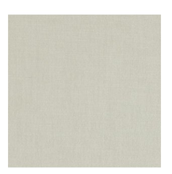
Maldives Straw 68% Polyester/32% Cotton Approx. 138cm wide Plain Dual Purpose 40,000 Rubs FibreGuard | Flame Retardant