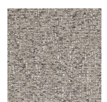
Omni Plaza 100% Polyester Approx. 145cm wide Plain Upholstery 100,000 Rubs FibreGuard | Flame Retardant