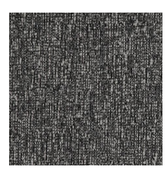
Omni Carbon 100% Polyester Approx. 145cm wide Plain Upholstery 100,000 Rubs FibreGuard | Flame Retardant