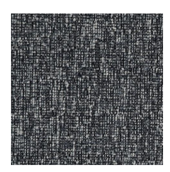
Omni Shadow 100% Polyester Approx. 145cm wide Plain Upholstery 100,000 Rubs FibreGuard | Flame Retardant