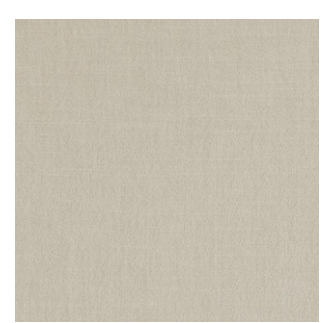
Maldives Rattan 68% Polyester/32% Cotton Approx. 138cm wide Plain Dual Purpose 40,000 Rubs FibreGuard | Flame Retardant