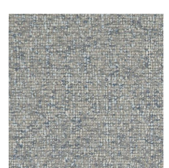
Omni Cloud 100% Polyester Approx. 145cm wide Plain Upholstery 100,000 Rubs FibreGuard | Flame Retardant