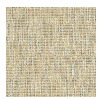
Omni Harvest 100% Polyester Approx. 145cm wide Plain Upholstery 100,000 Rubs FibreGuard | Flame Retardant