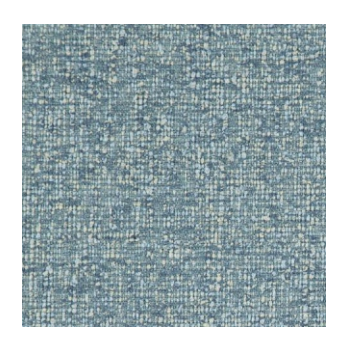
Omni Captain 100% Polyester Approx. 145cm wide Plain Upholstery 100,000 Rubs FibreGuard | Flame Retardant