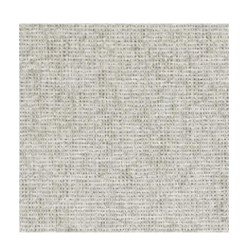
Omni Flax 100% Polyester Approx. 145cm wide Plain Upholstery 100,000 Rubs FibreGuard | Flame Retardant