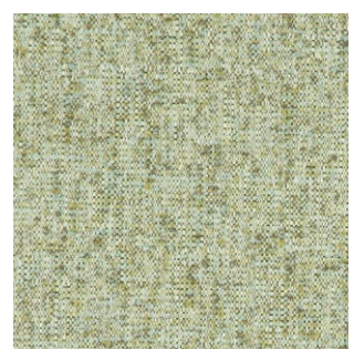
Omni Swamp 100% Polyester Approx. 145cm wide Plain Upholstery 100,000 Rubs FibreGuard | Flame Retardant