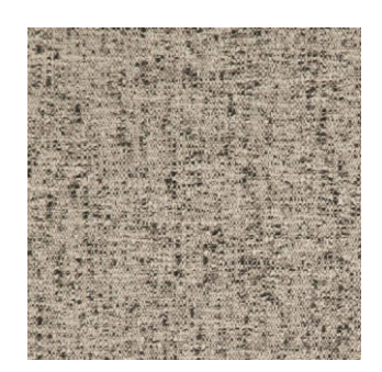
Omni Fungi 100% Polyester Approx. 145cm wide Plain Upholstery 100,000 Rubs FibreGuard | Flame Retardant