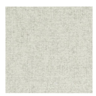
Omni Sand 100% Polyester Approx. 145cm wide Plain Upholstery 100,000 Rubs FibreGuard | Flame Retardant