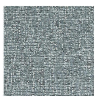
Omni Mosaic 100% Polyester Approx. 145cm wide Plain Upholstery 100,000 Rubs FibreGuard | Flame Retardant