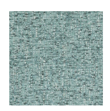
Omni Emerald 100% Polyester Approx. 145cm wide Plain Upholstery 100,000 Rubs FibreGuard | Flame Retardant