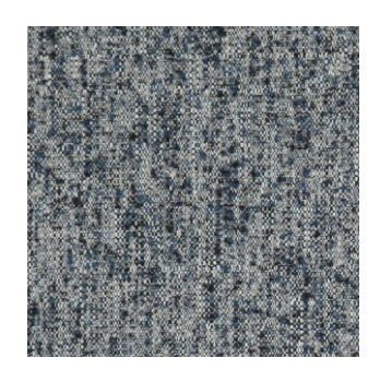
Omni Petrol 100% Polyester Approx. 145cm wide Plain Upholstery 100,000 Rubs FibreGuard | Flame Retardant