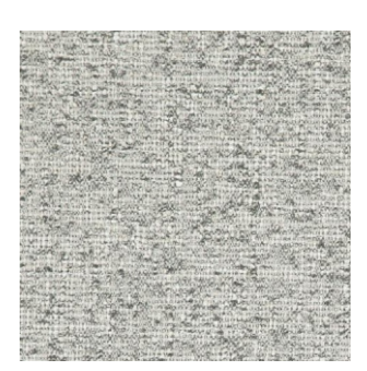
Omni Gull 100% Polyester Approx. 145cm wide Plain Upholstery 100,000 Rubs FibreGuard | Flame Retardant