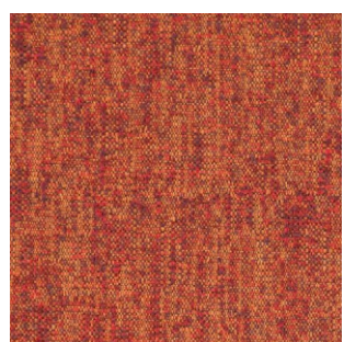
Omni Tabasco 100% Polyester Approx. 145cm wide Plain Upholstery 100,000 Rubs FibreGuard | Flame Retardant