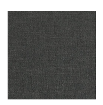
Maldives Ebony 68% Polyester/32% Cotton Approx. 138cm wide Plain Dual Purpose 40,000 Rubs FibreGuard | Flame Retardant