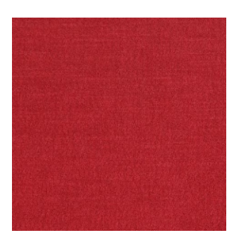
Maldives Vino 68% Polyester/32% Cotton Approx. 138cm wide Plain Dual Purpose 40,000 Rubs FibreGuard | Flame Retardant