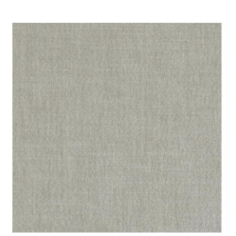
Maldives Penguin 68% Polyester/32% Cotton Approx. 138cm wide Plain Dual Purpose 40,000 Rubs FibreGuard | Flame Retardant