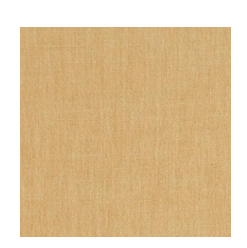
Maldives Gold 68% Polyester/32% Cotton Approx. 138cm wide Plain Dual Purpose 40,000 Rubs FibreGuard | Flame Retardant