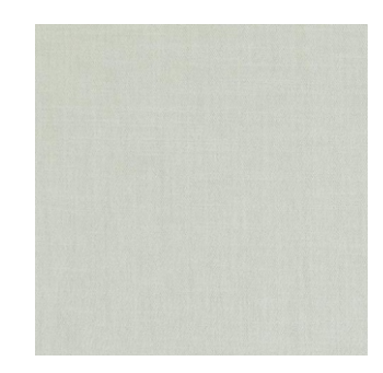
Maldives Marble 68% Polyester/32% Cotton Approx. 138cm wide Plain Dual Purpose 40,000 Rubs FibreGuard | Flame Retardant