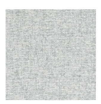
Omni Shale 100% Polyester Approx. 145cm wide Plain Upholstery 100,000 Rubs FibreGuard | Flame Retardant