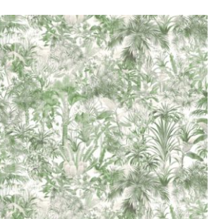
Oasis Malachite 100% Cotton 280cm drop (Railroaded) 50cm (Vertical Repeat) Dual Purpose - 20,000 rubs