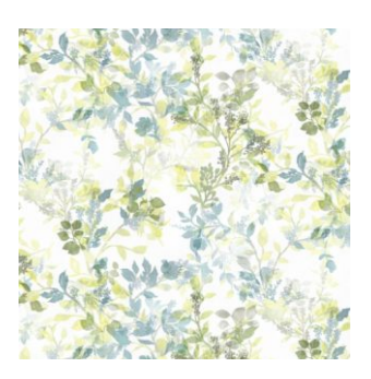
Mangrove Moss 100% Cotton 280cm drop (Railroaded) 70cm (Vertical Repeat) Dual Purpose - 20,000 rubs