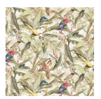
Macaw Parchment 100% Cotton 280cm drop (Railroaded) 66cm (Vertical Repeat) Dual Purpose - 20,000 rubs