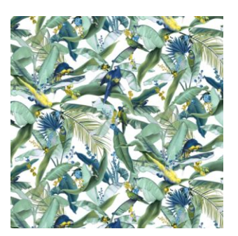
Macaw Jade 100% Cotton 280cm drop (Railroaded) 66cm (Vertical Repeat) Dual Purpose - 20,000 rubs

Greenhouse Orchid 100% Cotton 280cm drop (Railroaded) 100cm (Vertical Repeat) Dual Purpose - 20,000 rubs