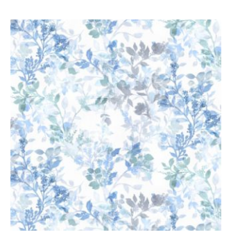
Mangrove Capri 100% Cotton 280cm drop (Railroaded) 70cm (Vertical Repeat) Dual Purpose - 20,000 rubs