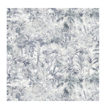
Oasis Phantom 100% Cotton 280cm drop (Railroaded) 50cm (Vertical Repeat) Dual Purpose - 20,000 rubs