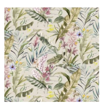
Exotic Blush 100% Cotton 280cm drop (Railroaded) 50cm (Vertical Repeat) Dual Purpose - 20,000 rubs