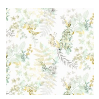
Everglade Celadon 100% Cotton 280cm drop (Railroaded) 70cm (Vertical Repeat) Dual Purpose - 20,000 rubs