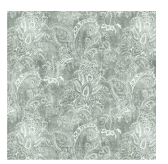
Equator Sage 100% Cotton 280cm drop (Railroaded) 65cm (Vertical Repeat) Dual Purpose - 20,000 rubs

Equator Carbon 100% Cotton 280cm drop (Railroaded) 65cm (Vertical Repeat) Dual Purpose - 20,000 rubs