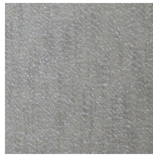
Glitter Sterling 100% Polyester 300cm drop Plain sheer Curtaining