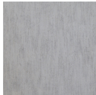
Misty Gravel 100% Polyester 300cm drop Plain sheer Curtaining