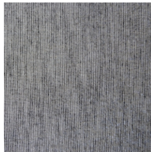
Silhouette Obsidian 100% Polyester 300cm drop Vertical Stripe Curtaining