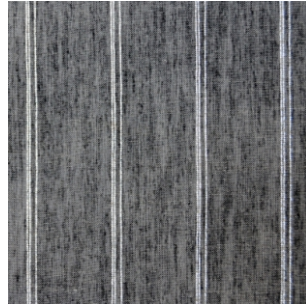
Profile Obsidian 100% Polyester 300cm drop Vertical Stripe Curtaining