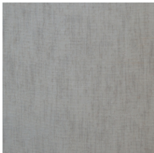
Misty Earth 100% Polyester 300cm drop Plain sheer Curtaining