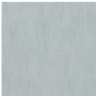
Misty Mint 100% Polyester 300cm drop Plain sheer Curtaining