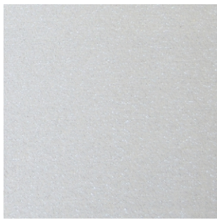
Glitter Pearl 100% Polyester 300cm drop Plain sheer Curtaining