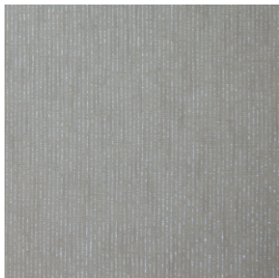
Silhouette Limestone 100% Polyester 300cm drop Vertical Stripe Curtaining