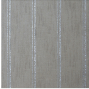
Profile Limestone 100% Polyester 300cm drop Vertical Stripe Curtaining

Following the success of Mystery and Whispers we bring you the Shadows sheer collection. Misty, a 100% Polyester textured sheer has been yarn dyed for a linen look. Silver lurex has been added to a plain texture to create simple stylish stripes, while extra lurex adds a subtle shimmer in design Glitter. We included our best selling sheers in this book for your convenience.