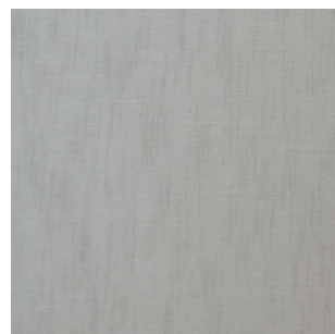
Misty Windrift 100% Polyester 300cm drop Plain sheer Curtaining