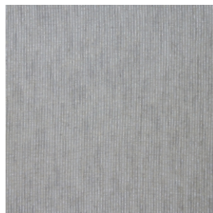
Silhouette Sterling 100% Polyester 300cm drop Vertical Stripe Curtaining