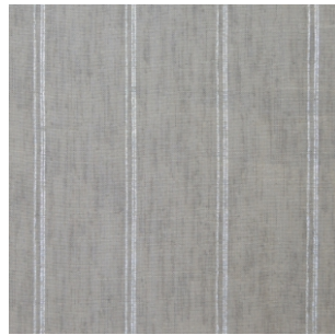
Profile Sterling 100% Polyester 300cm drop Vertical Stripe Curtaining