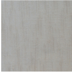
Misty Buff 100% Polyester 300cm drop Plain sheer Curtaining