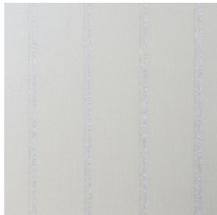
Profile Pearl 100% Polyester 300cm drop Vertical Stripe Curtaining