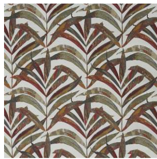
Windward Mist 59% Linen/41% Cotton 138cm wide 38cm Dual Purpose - 29,000 rubs