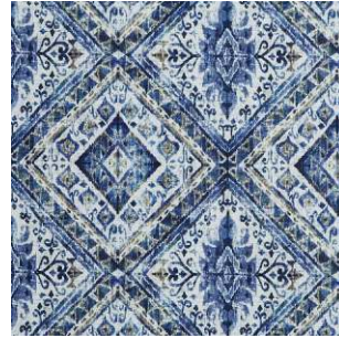
Banyan Indigo 59% Linen/41% Cotton 138cm wide 44cm Dual Purpose - 29,000 rubs