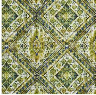
Banyan Cactus 59% Linen/41% Cotton 138cm wide 44cm Dual Purpose - 29,000 rubs

In a glorious array of luscious shades, Tahiti is based on five dramatic digital prints which appear as if painted across a linen-cotton union. Inspiration has been drawn from tropical beaches and Moorish settings.