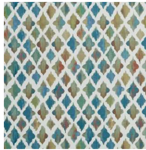
Monsoon Waterfall 59% Linen/41% Cotton 138cm wide 62cm Dual Purpose - 29,000 rubs