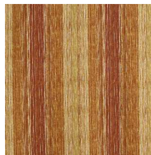
Seagrass Spice 59% Linen/41% Cotton 138cm wide 25cm Dual Purpose - 29,000 rubs