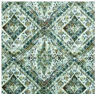
Banyan Waterfall 59% Linen/41% Cotton 138cm wide 44cm Dual Purpose - 29,000 rubs