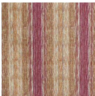
Seagrass Mist 59% Linen/41% Cotton 138cm wide 25cm Dual Purpose - 29,000 rubs