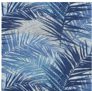
Jungle Indigo 50% Cotton/50% Linen 147cm wide 62cm Dual Purpose - 36,000 rubs