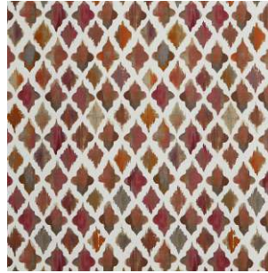
Monsoon Mist 59% Linen/41% Cotton 138cm wide 62cm Dual Purpose - 29,000 rubs