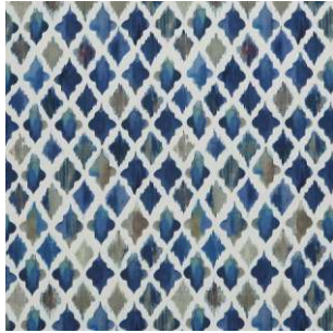
Monsoon Indigo 59% Linen/41% Cotton 138cm wide 62cm Dual Purpose - 29,000 rubs