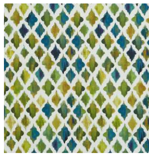
Monsoon Cactus 59% Linen/41% Cotton 138cm wide 62cm Dual Purpose - 29,000 rubs