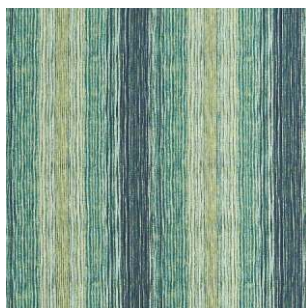
Seagrass Waterfall 59% Linen/41% Cotton 138cm wide 25cm Dual Purpose - 29,000 rubs