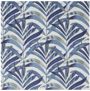
Windward Indigo 59% Linen/41% Cotton 138cm wide 38cm Dual Purpose - 29,000 rubs