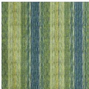
Seagrass Cactus 59% Linen/41% Cotton 138cm wide 25cm Dual Purpose - 29,000 rubs