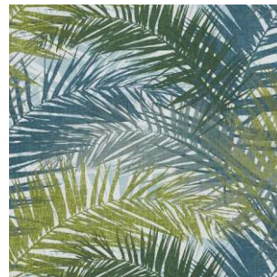
Jungle Aruba 50% Cotton/50% Linen 147cm wide 62cm Dual Purpose - 36,000 rubs