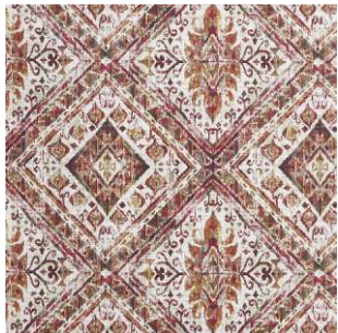
Banyan Mist 59% Linen/41% Cotton 138cm wide 44cm Dual Purpose - 29,000 rubs