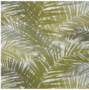
Jungle Palm 50% Cotton/50% Linen 147cm wide 62cm Dual Purpose - 36,000 rubs