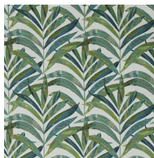
Windward Cactus 59% Linen/41% Cotton 138cm wide 38cm Dual Purpose - 29,000 rubs