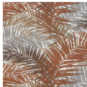
Jungle Mandarin 50% Cotton/50% Linen 147cm wide 62cm Dual Purpose - 36,000 rubs