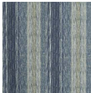
Seagrass Indigo 59% Linen/41% Cotton 138cm wide 25cm Dual Purpose - 29,000 rubs