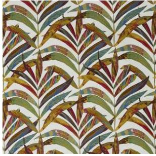
Windward Spice 59% Linen/41% Cotton 138cm wide 38cm Dual Purpose - 29,000 rubs