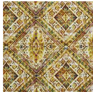
Banyan Spice 59% Linen/41% Cotton 138cm wide 44cm Dual Purpose - 29,000 rubs