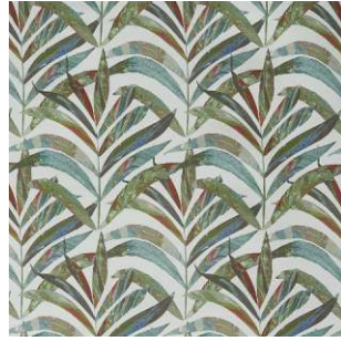
Windward Waterfall 59% Linen/41% Cotton 138cm wide 38cm Dual Purpose - 29,000 rubs