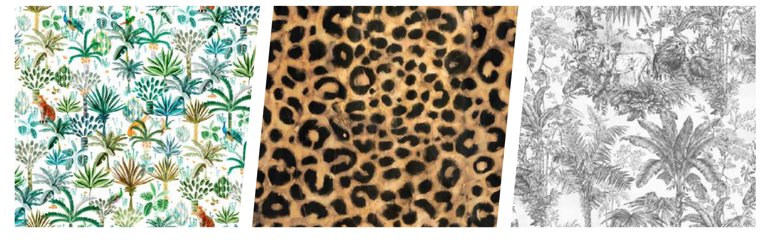
WILD SIDE ~ untamed dual purpose prints

More than ever our connection to nature and all that it offers has become essential to our well-being. The Wild Side print collection draws inspiration from the world of luscious vegetation and wild animals evoking memories of places visited and enticing us to feed our souls by reconnecting with the wild..